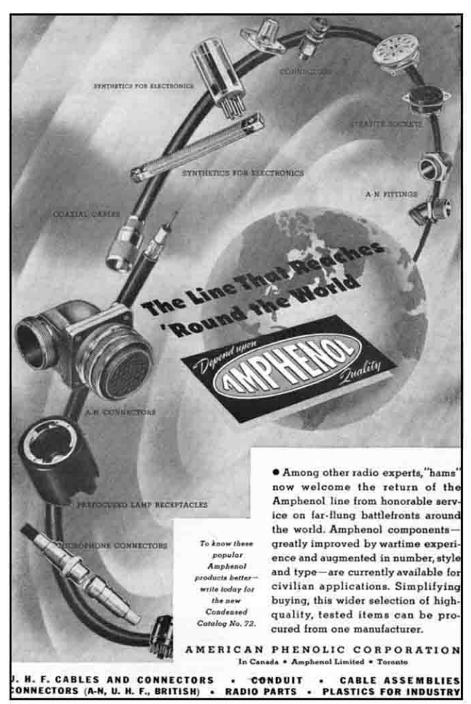
Immediately after World War II, companies such as Amphenol were making coaxial cable available to amateurs. This advertisement was published in the December 1945 issue of QST.

(The early cable is similar to modern air-dielectric cables that use a plastic or Teflon helix to keep the center conductor centered in the outer shield/jacket.)