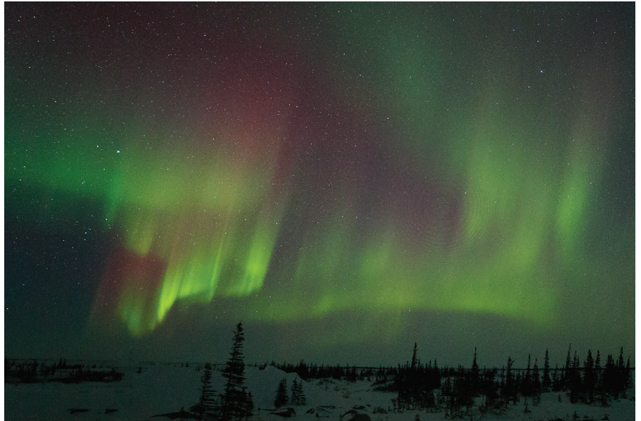
Figure 4 — The Aurora Borealis display, also known as the Northern Lights.

One grid square measures 1° latitude by 2° longitude and measures approximately 70 × 100 miles in the continental US. A grid square is indicated by two letters (the field) and two numbers (the square) — for example, FN31, the grid square within which W1AW, ARRL's Hiram Percy Maxim Memorial Station, resides. Generally, grid squares are used as part of a contact exchange at VHF and above.