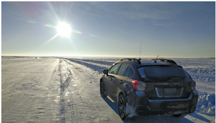
Figure 1 — The Dettah ice road proved to be a great place to operate satellites from, due to its clear horizon (this is about as high as the Sun gets this far north in winter).

Before the trip to the NT, I did two practice trips to Manitoba and Ontario to get used to operating entirely outdoors in the extreme cold (temperatures as low as -20^{\circ}\text{F} ). Getting used to tuning on linear transponder satellites with huge gloves on was a bit of a challenge,