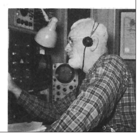
My first published contest photo in the October 1966 CD Bulletin.

was both exhilarating and exhausting for me.