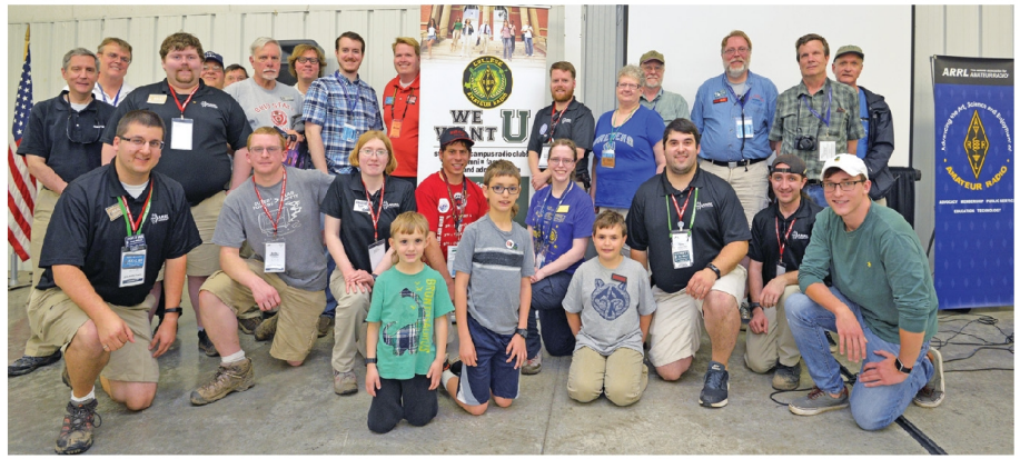
Students, faculty, and other interested hams discussed a range of topics related to collegiate clubs at the 2018 Hamvention Collegiate Amateur Radio Forum. From funding, to social media, to alumni networks, to the first ever Collegiate QSO Party, countless ideas were exchanged on how to support college clubs.

Visit the official event page at www.gatorradio.org/collegiate.html . You can also follow the progress on the Collegiate Amateur Radio Initiative Facebook group, or go to www.arrl.org/WeWantU . All hams are invited to party with the college clubs in September!