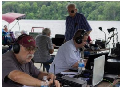
Figure 3 Paintsville FD ARC