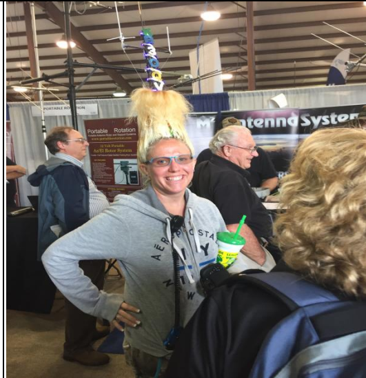
MY ANTENNA IS ON WHAT FREQUENCY?