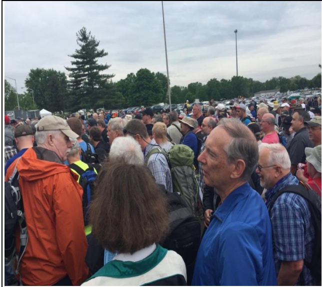
LET THE FUN GAMES BEGIN