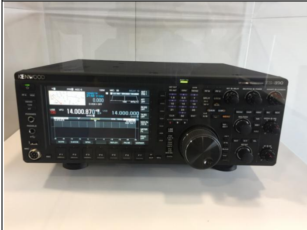
THE NEW KENWOOD TS-890S