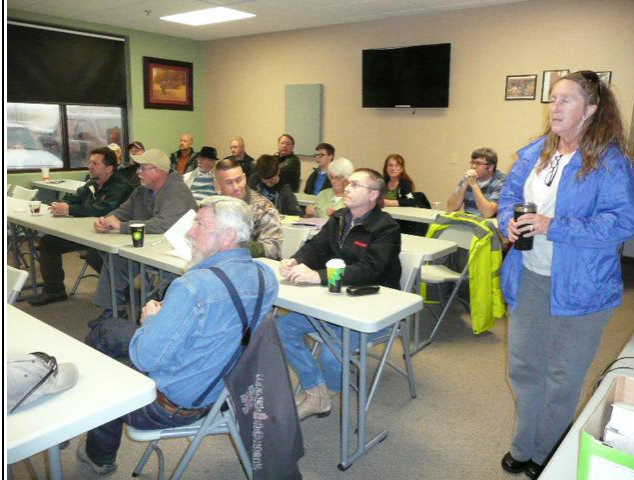
Figure 6 Morehead ARS Meeting