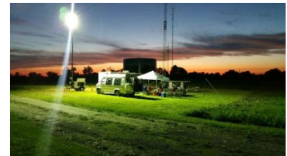
Figure 2 Woodford Co

Field Day is always the fourth full weekend of June, beginning at 1800 UTC Saturday and running through 2059 UTC Sunday. Field Day 2018 is June 23-24.