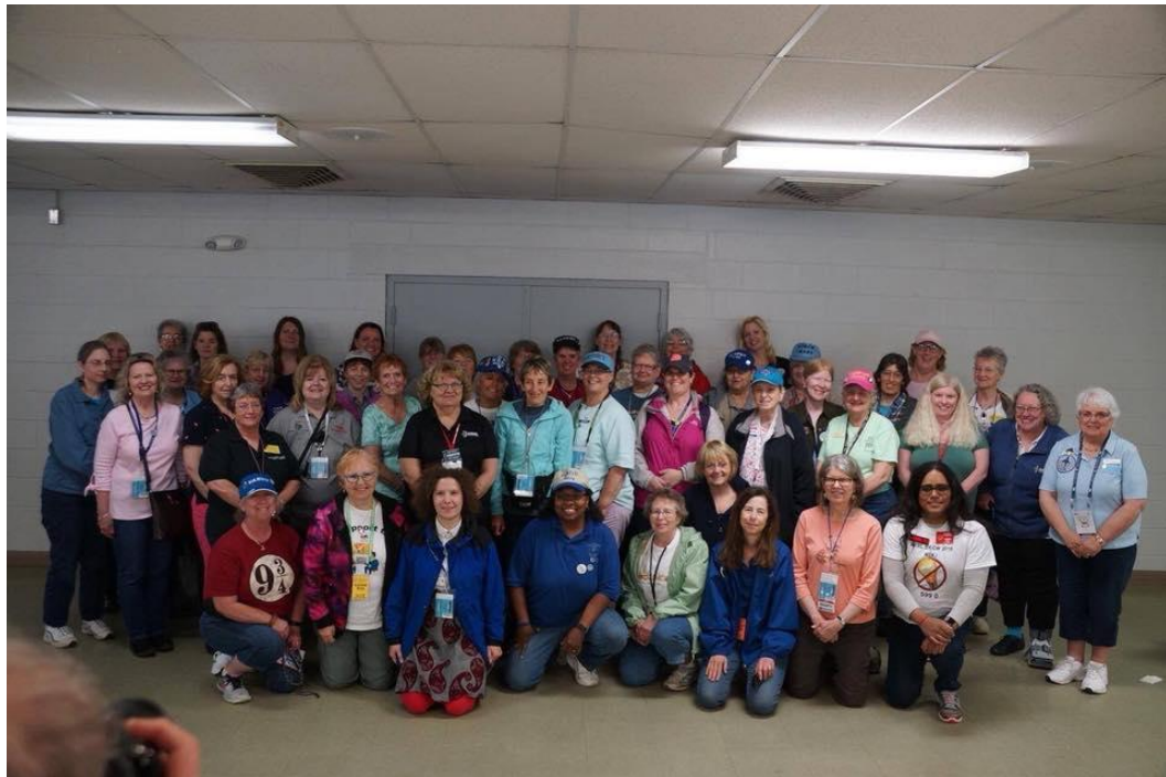
Figure 4 Dayton YL's Hamvention 2018