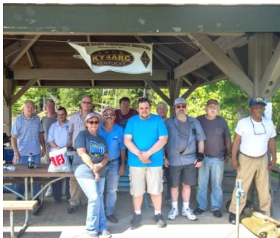
Figure 1 Paintsville ARC Group FD