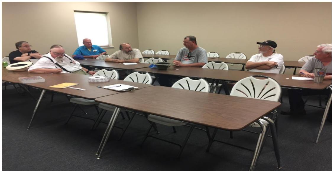
Figure 9 Area ARES members at Princeton