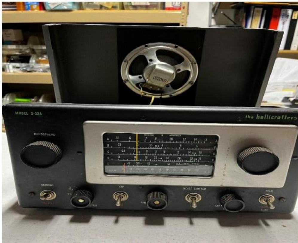
Figure 1 HALLICRAFTERS S53A RECEIVER

Spring also implies “Spring Clean-Up” . . . . . In the ham shack, that can mean LOTS of work! I have purged much paper from my filing cabinets and even forced myself to get rid of sixty years accumulation of extraneous hardware that I’d saved for “some day”; but, then came the “hard stuff”- the electronic components, the test equipment and the ham gear. Even the old stuff- the ARC-5 receivers, the Heath AR-3, various Zenith Transosceanics, the defunct Hallicrafters S53A that I picked-up for $20 at a hamfest with intention of refurbishing just because I drooled over it in the Allied catalogs seventy years ago . . . . . and other items including my original J-38 straight key that I bought new surplus for a buck fifty way back. Yes, it’s not easy to part with those things that take us back to our younger years, but of course, to some extent it is necessary to “de-clutter” our ham shacks. The most nostalgic items in my shack I must retain, but